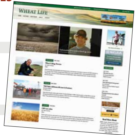
*Animated ads must be camera ready